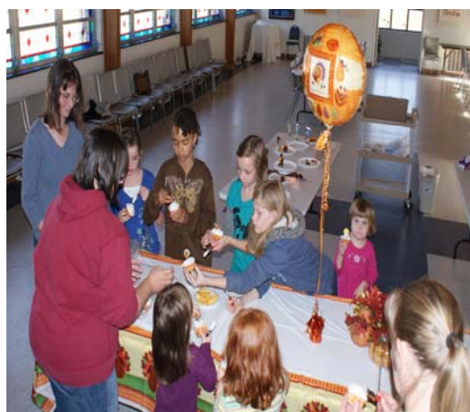
Lutheran Girl Pioneers Learn The Art of Cake Decorating