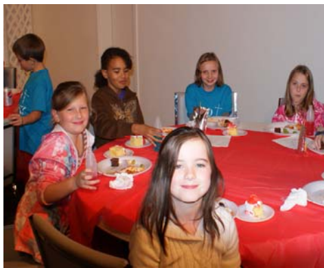
Happy Birthday, Martin Luther! From the God Rockz Kids at St. James

Children at Red Bank Elementary School need our help. In the narthex there is a basket for Red Bank's children who go hungry on the weekends. We are filling back packs with individually wrapped items, including microwaveable cups of mac & cheese, microwaveable Chef-Boyardee items, individually wrapped grits, oatmeal, and cereal packets, boxed juices, granola bars, packs of crackers, pop-tarts, fruit cups, applesauce cups, and pudding cups. Thanks for your help!